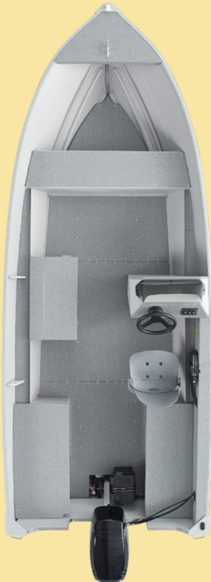
Angler 500 SC