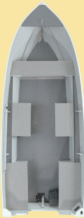
Angler 500 T