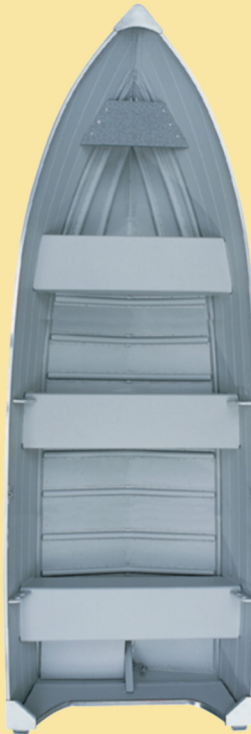
SF 490 T